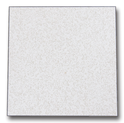
Laminate Topped Panel