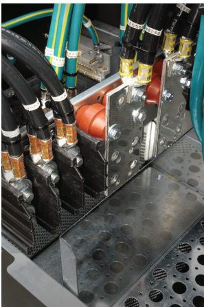
Input power connections with provisions for 2 hole lugs are standard on the Liebert FDC. (208V and 380-415V, 50 Hz model shown)

The Liebert FDC 208V and 380-415V, 50 Hz models use inline 42-pole panelboards with wide-open access channels. The four panelboards are separated into vertical compartments with individual hinged access covers. The Liebert FDC 380-480V, 60 Hz unit uses standard side-by-side 42-pole 400A panelboards, for more capacity at a higher voltage. With one panelboard in the front and one in the rear, there is plenty of space in each compartment for wiring. Hinged access covers allow easy access for service and reconfiguring.