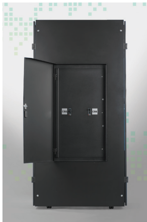
Optional Maintenance Tie-Breakers allow connection to different inputs without shutting down the load.