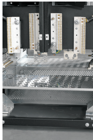
Ground and neutral output connections are conveniently located in the bottom of the unit for easy wiring. Conduit-landing plate provided with plugged holes — no knock-outs.