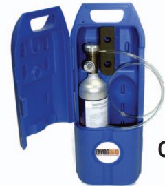
Optional Calibration Kit